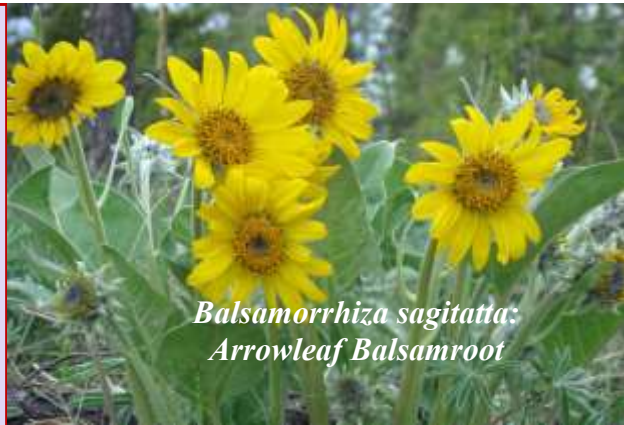
Balsamorhiza sagittata: Arrowleaf Balsamroot