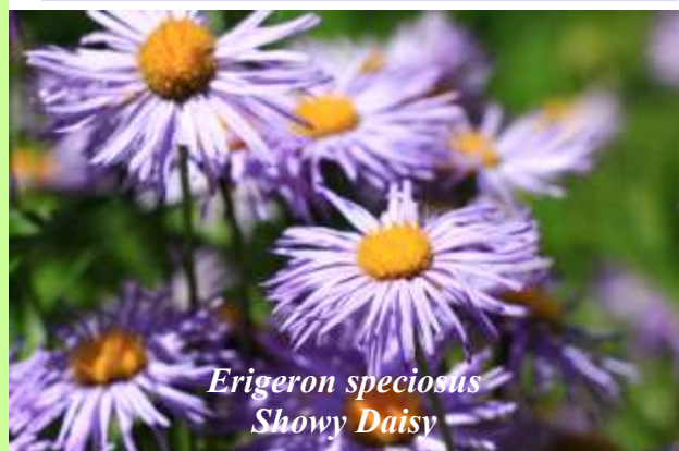
Erigeron speciosus Showy Daisy

The Nursery 7875 E Highway 54 Athol, Idaho Please call first (208) 683-2387